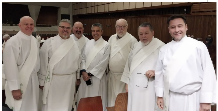
Archdiocese of Santa Fe Deacons

“Everyone knows what it is to hope. In the heart of each person, hope dwells as the desire and expectation of good things to come, despite not knowing what the future may bring. Even so, uncertainty about the future may at times give rise to conflicting feelings, ranging from confident trust to hesitation and doubt. Often, we come across people who are discouraged, pessimistic, and cynical about the future, as if nothing could possibly bring them happiness. For all of us, may the Jubilee be an opportunity to be renewed in hope.”